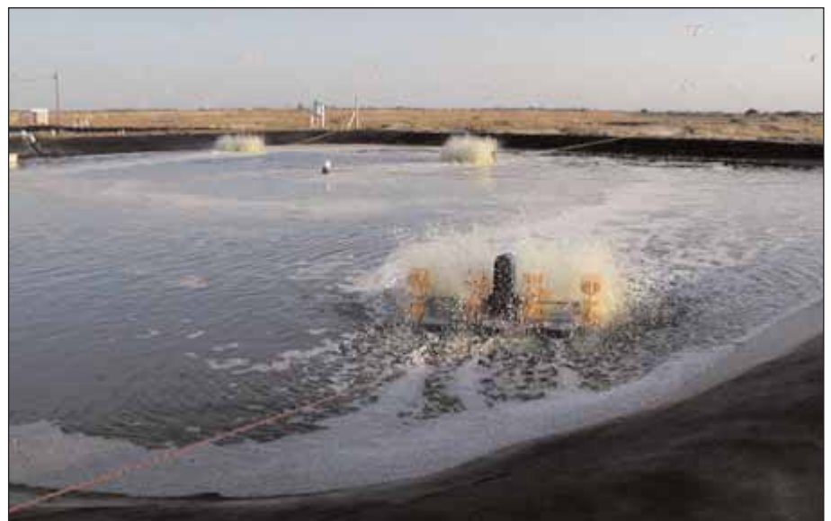
Figure 5. Intensive pond production at the Texas Agricultural Experiment Station in Corpus Christi, Texas.

Once in the ponds, shrimp are fed a 30 to 35% protein feed at rates of 3 to 6 percent bw/d. Feed trays are used to prevent overfeeding. The water must be aerated at a rate of 10 to 18 hp per acre (Fig. 5). The general pond culture period for 90-count shrimp (5.0 g) is 90 days. Ponds stocked with 0.5-g shrimp at a density of 200 per m 2 can grow at a rate of 0.5 g per week, have 70 percent survival, and produce up to 7,000 kg/ha (6,160 lbs/ac) of market size (5.0-g) live bait shrimp.