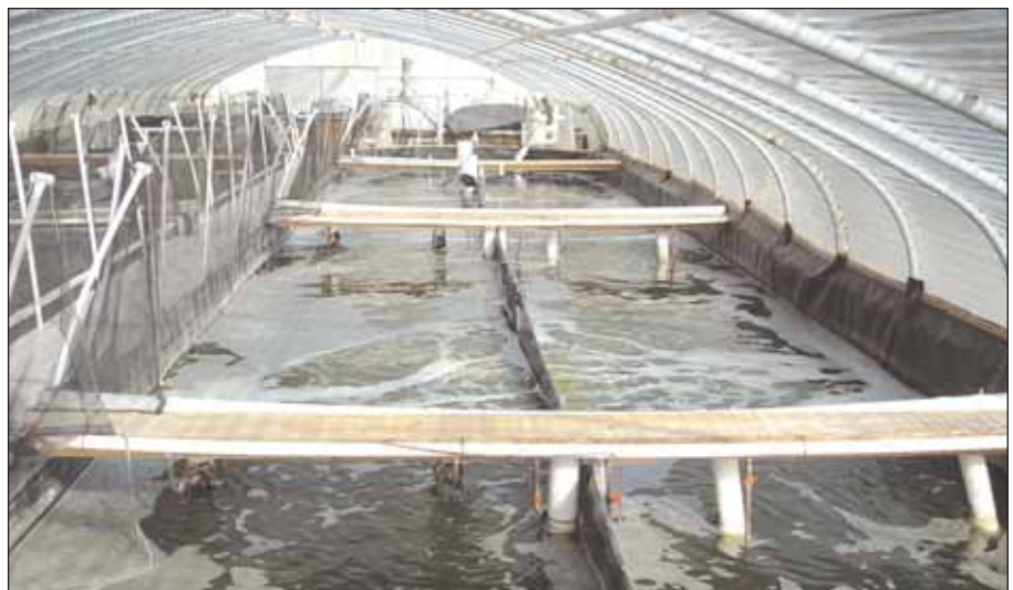
Figure 4. Intensive greenhouse nursery at Mote Marine Laboratory.

Nursery culture water is maintained at a temperature of 28 to 29 °C (82.4 to 84.2 °F), a dissolved oxygen level of 5 to 7 mg/L, a pH of 7.5 to 8.5, and a Secchi depth of 25 to 30 cm. Ten to 14 days before PL arrive from a hatchery, the culture tanks are filled with seawater (20 to 35 ppt). Then the water is sterilized with sodium hypochlorite (household bleach at 10 ppm) to prevent the introduction of pathogens from incoming waters. The treated culture water is allowed to sit for 24 hours without aeration to prevent a rapid reduction of chlorine. During this period