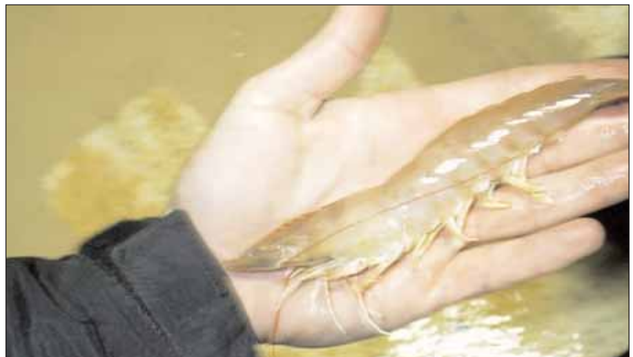
Figure 2. Sourcing gravid females at night onboard a shrimp boat.

Fertilized eggs will hatch within 24 hours of fertilization at 28 °C (82.4 °F). The nauplii are allowed to remain in hatching tanks until they metamorphose into the last