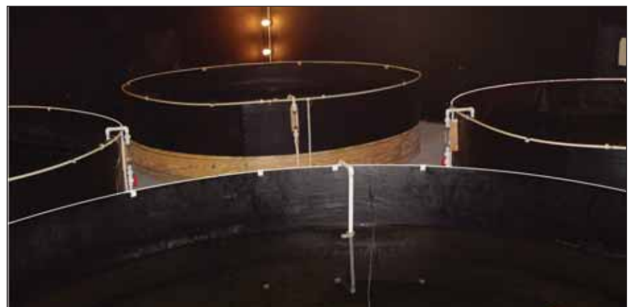
Figure 3. Maturation system.