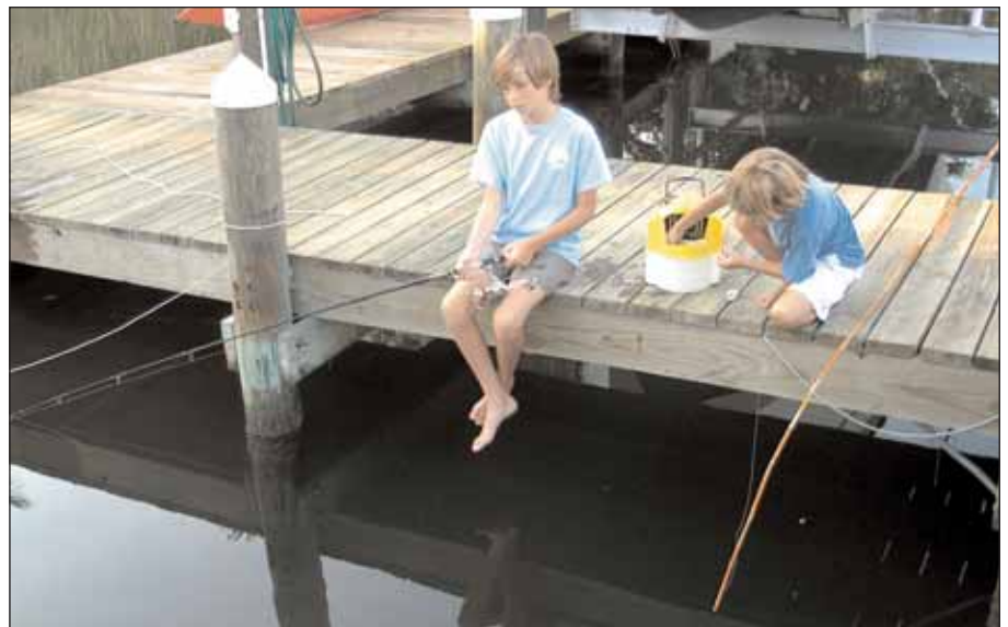
Figure 1. The most valuable consumers of live bait shrimp.

The main impediment to bait shrimp aquaculture has been the lack of consistent supplies of disease-free postlarvae (PL). Without them, both researchers and commercial aquaculturists have relied on two methods of obtaining PL.